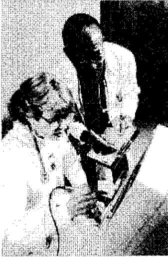
Doctor and nurse working on computer

The word data (DAY-tuh) is plural. It refers to a set of information. The singular form is datum , one piece of information.