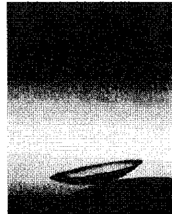
Medical products, such as hearing aids, pacemakers, and contact lenses are tested before being sold to the public.